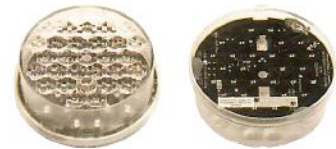
Optically enhanced LED Lamps

The 5", amber, PAR 46, LED lamp is a sophisticated, high-output, low-power-consumption, sealed-beam lamp with a life that is unparalleled by other conventional arrow board lamps. The lamp is backed by a five-year warranty.