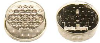
Optically enhanced LED Lamps

The 5" amber 46 LED lamp is a sophisticated, high-output, low-power-consumption sealed-beam lamp that provides for a lamp life unparalleled by other conventional arrow board lamps. The lamp is backed by a five-year warranty.