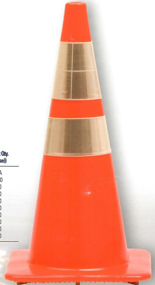
Standard 28" Cone with 6" & 4" Reflective Collars

Available plain or with reflective collars attached